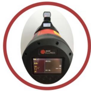
Equipped with dual display for easier reading