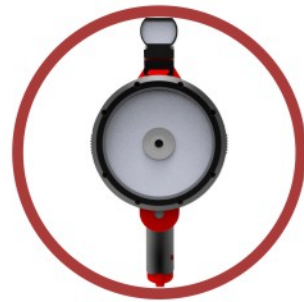
Larger light entrance path Ultra-long detection distance