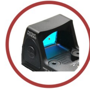
Internally powered optical sight Easier aiming and positioning