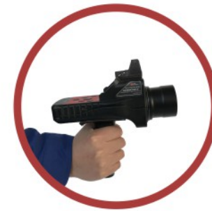
Small and lightweight, easy to carry