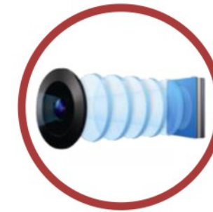
Efficient optical design Longer detection distance