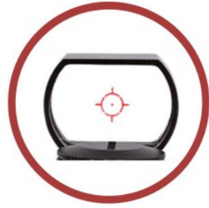
Equipped with optical sight Easier aiming and positioning